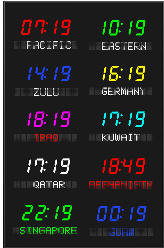
Model 6612AB - 2.5" time, 1.2" zone labels, 10 zones

Display: 10 zone, 5 digit user changeable multi-color bar segment LED time displays with 10 character dot matrix LED zone labels.